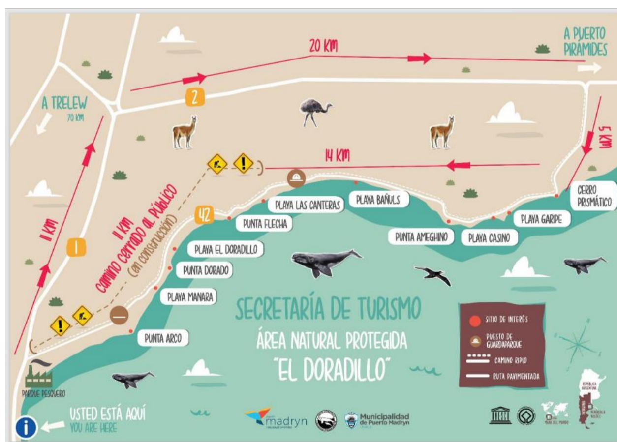
Illustrative Map - ANP El Doradillo